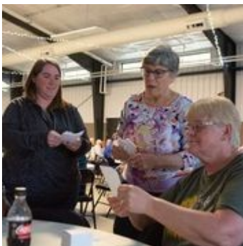
Time for ballot counting