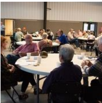
Members enjoying each other