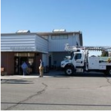
Going into the 2021 Annual Meeting