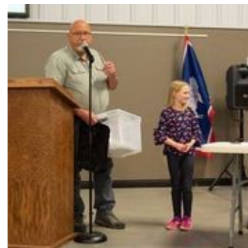
Drawing for the progressive drawing